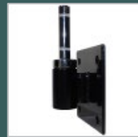
Vertical Wall Bracket