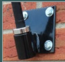
Angled Wall Bracket