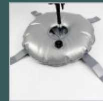
Cross Brace with Waterbase